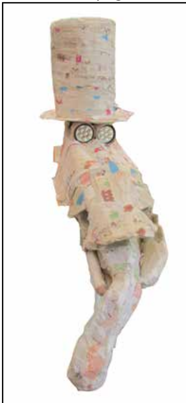
In the Works!

cornerstone of the outreach programs LCS provides to the Mexican community. Other such LCS programs include English as a Second Language, the Spanish Library, the new Chess Club, and Student Aid.